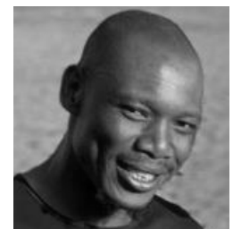
DELIVERIES Prince Sagweni